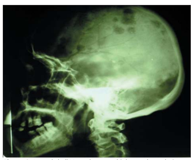
Figure 2. Lateral skull X-ray shows multiple punch out lesions.

Osteolytic areas in several bones were detected. Roentgenograms revealed multiple lytic lesions of the skull and right and left ribs. In abdominal sonography, there were two cystic lesions in the anterior and posterior parts of the right lobe of the liver. The bone marrow biopsy showed increased cellularity (> 30%), and more than 30% of these cells were plasmocytes (Figure 4).