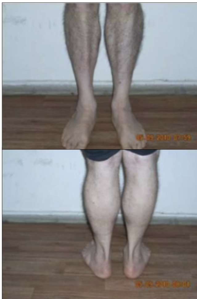
Figure 3. Atrophy in peroneal muscles (in the front and rear muscle groups)