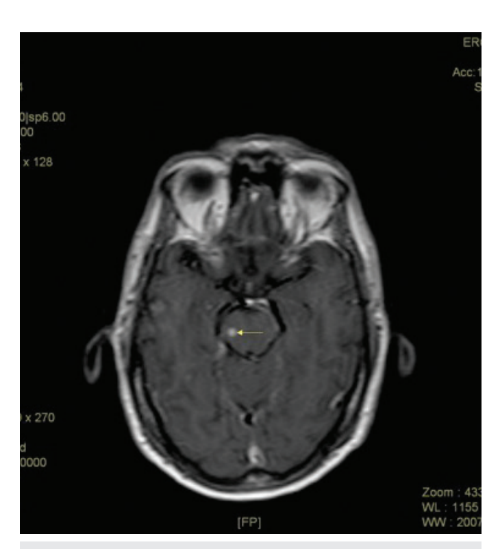
Figure 4. Nodular lesion in the right section of pons in T1-weighted sequence with contrast.