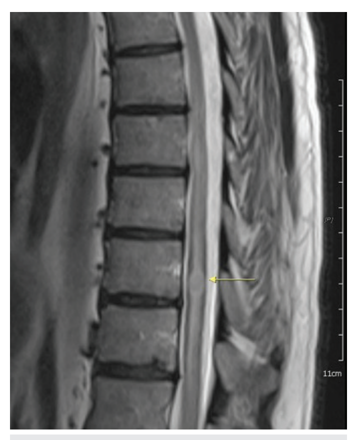
Figure 5. Intramedullary located hyperintense nodular lesion that caused mild expansion at the level of T10 as seen in T2-weighted sequence.