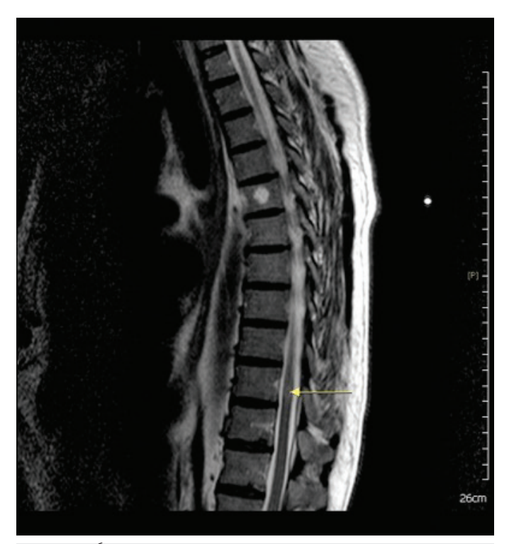
Figure 6. A significant improvement was observed in the edema effect of the T10-level intramedullary lesion, shown in the thoracic MRI taken for follow-up on intravenous methylprednisolone treatment.