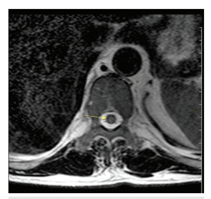
Figure 3. Intramedullary located hyperintense nodular finding at the level of thoracic vertebrae that causes mild expansion as seen in T2-weighted sequence.